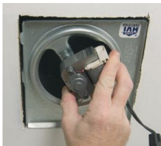
Snap in new motor to housing.