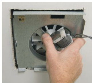
Remove old grille, unplug and remove motor.