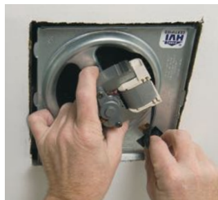
Plug motor into existing receptacle.