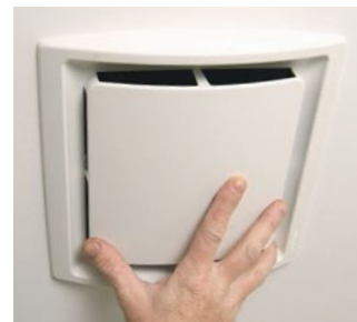
Attach grille springs to fan and push grille up against the ceiling.