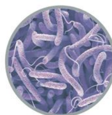
GRAM NEGATIVE BACTERIA